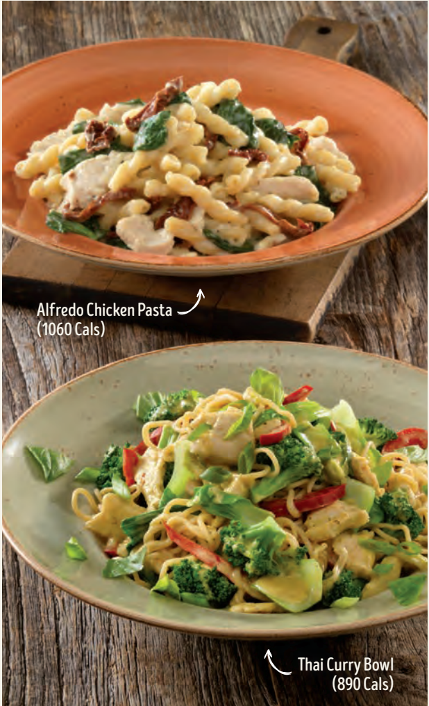
Alfredo Chicken Pasta (1060 Cals)