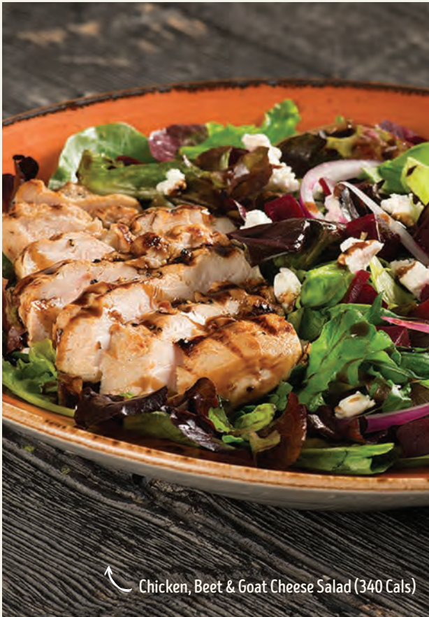
Chicken, Beet & Goat Cheese Salad (340 Cals)

Gluten-friendly penne, fresh spinach, goat cheese and basil pesto tossed in tomato sauce. 17.99 (790 Cals) Add a basil pesto grilled chicken breast 5.99 (170 Cals)