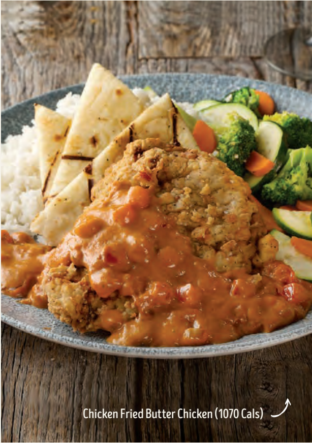
Chicken Fried Butter Chicken (1070 Cals)