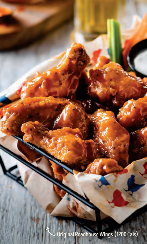
Original Roadhouse Wings (1200 Cals)

Two freshly grilled chicken breasts topped with our made in-house balsamic cream sauce. Served with your choice of side and freshly steamed veggies. 21.99 (770 - 1420 Cals)