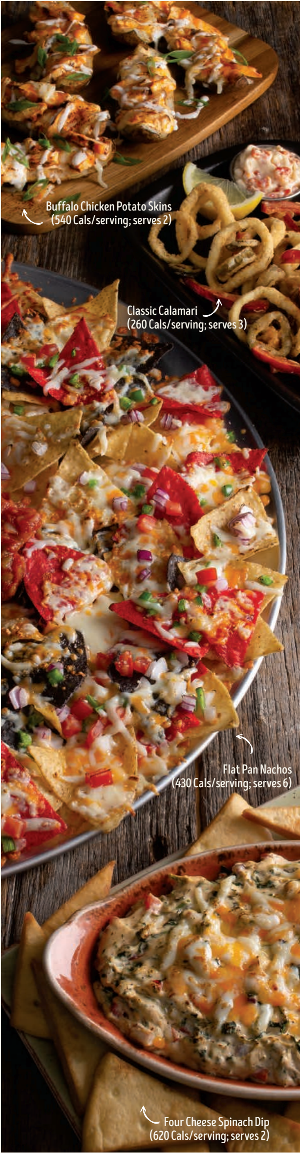
Buffalo Chicken Potato Skins (540 Cals/serving; serves 2)